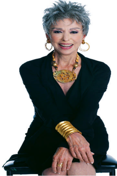
Rita Moreno (Performer, "West Side Story")