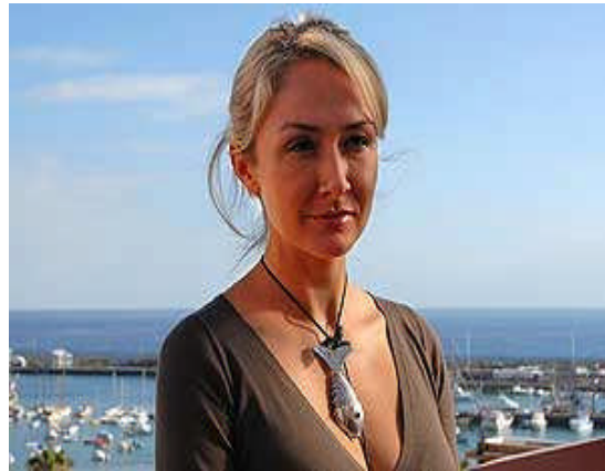
Alexandra Cousteau (Oceanographer, “Blue Legacy”)