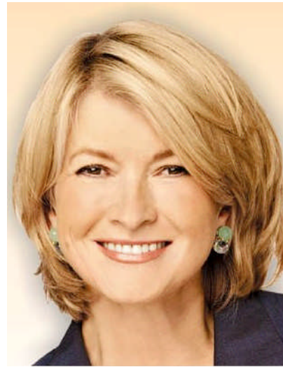
Barbara Walters (Talk Show Host, "20/20 & The View")