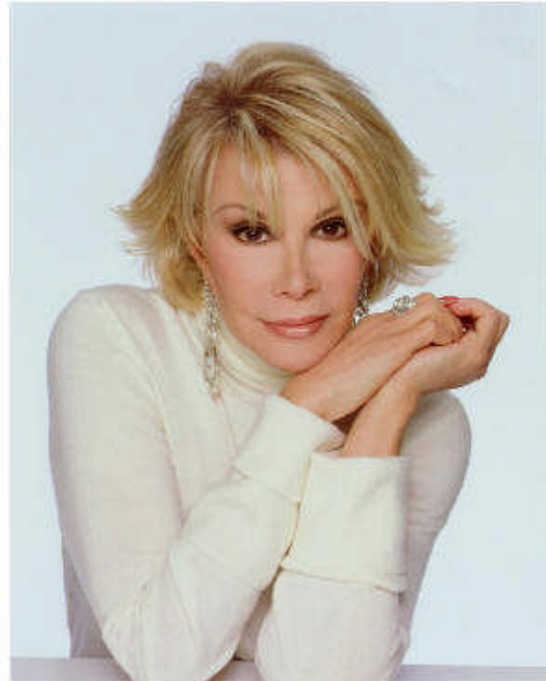
Joan Rivers (Comedian/ TV Personality, “A Piece of Work”)