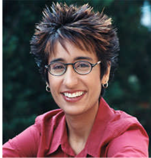
Irshad Manji (Author/ Professor, "The Trouble with Islam Today")